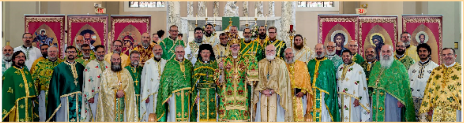
PLC June 2019

October 22-24: Fall Gathering YAM, SOYO & Antiochian Women