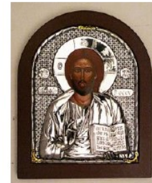
silver plated icons