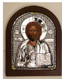
silver plated icons