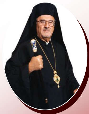
With His Eminence METROPOLITAN PHILIP Archbishop of New York and Metropolitan of All North America

Followed by Groundbreaking Ceremony and a Luncheon at St. Mary's Gymnasium